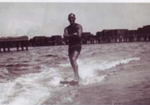
George Freeth is known for one of the people who introduced surfing to California for the first time. Same as Duke, he is a great water man who grew up in Waikiki.

Surfing may never have grabbed the publics and surfers imaginations any